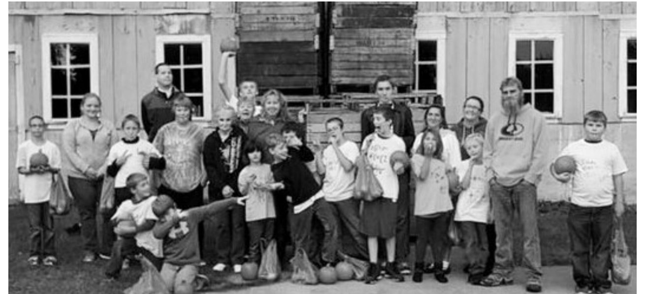
SK8 Club survives the hayride. No sighting of the Stumpy Field Witch this year!